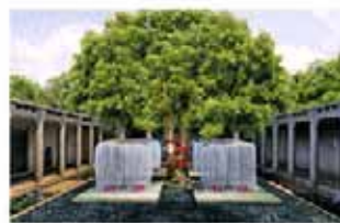
Thailand's Six Senses Erawan.