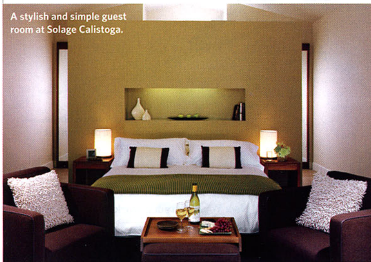
A stylish and simple guest room at Solage Calistoga.

At Solage Calistoga , Napa Valley's latest hot spot, biking and hiking are as much of a draw as wine tasting, and dress shirts and cocktail attire are so scarce, you'd think they were forbidden. This property from the people behind Auberge Resorts (Auberge du Soleil, Inn at Palmetto Bluff) is intentionally not a formal, Tuscan-inspired wine-country resort. Kids and pets are welcome, and the retreat was built with environmentally friendly materials. Eighty-nine rooms are set within fifty-two agri-tourism-style cottages, built with wood siding, gabled roofs and cross bracing and scattered around the former horse pasture. The "studios" are more urbane inside, with open floor plans, concrete floors, Wi-Fi and iPod docks. Two bicycles per room are provided for outings to wineries and mountain trails. For indulging on-site, there's a spa showcasing skin-care guru Kate Somerville's facials and, in a nod to Calistoga's heritage as a proto-spa destination, mud treatments and soaking baths fed by the region's geothermal springs. Consider it luxury for the un-buttoned-up set. Studios from $325. 866-942-7442; solagecalistoga.com. MANDY BEHBEHANI