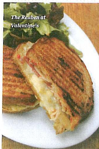
The Reuben at Valentine's