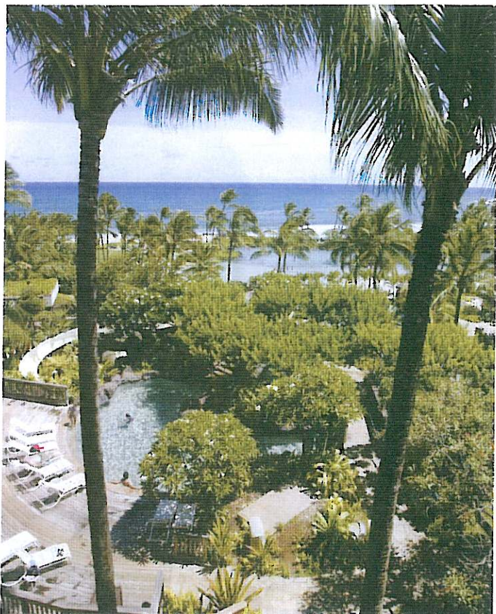
The Grand Hyatt Kauai Resort and Spa lies on the island's south coast, in Po'ipu.