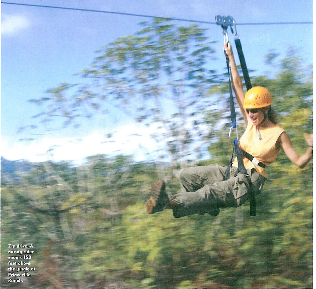
Zip drive: A daring rider zooms 150 feet above the jungle at Princeville Ranch.

But my husband, Patrick, and I were facing the challenge of a vacation with teenagers. Parents are always looking for ways to bond with their children, but those can get hard to find as kids develop their own interests. We thought Kauai would cater to adventurous souls like our 13-year-old, Caitlin, and to leisure lovers like me and our other daughter, 15-year-old Sara. ▶ 58