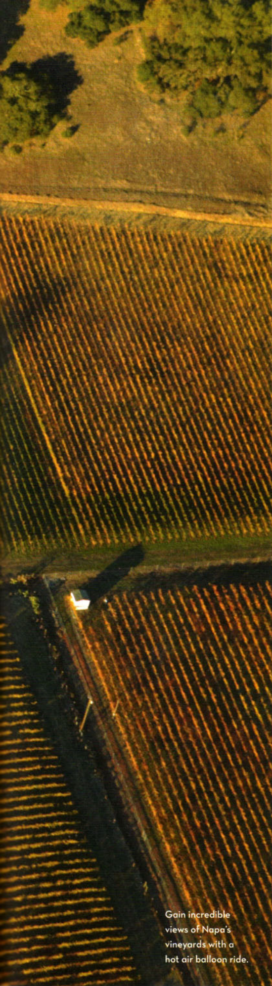
Gain incredible views of Napa's vineyards with a hot air balloon ride.

Fall is undoubtedly the best time to visit the wine country; the optimal weather, excitement of crush and fewer tourists make it an easy choice for a quick getaway. If that's not enough incentive, consider that a day (and a night) away could be just what your mind, body and soul need before the rush of the holidays. According to the Mayo Clinic, "relaxation is a process that decreases the wear and tear on your mind and body from the challenges and hassles of daily life." As we wind down 2009, which for many has indeed been a year of wear and tear, it's time to take care of ourselves with a little Wine Country 101. What follows are six different scenarios for a Napa or Sonoma visit, including options for getting the most from your recession-recovering dollar.