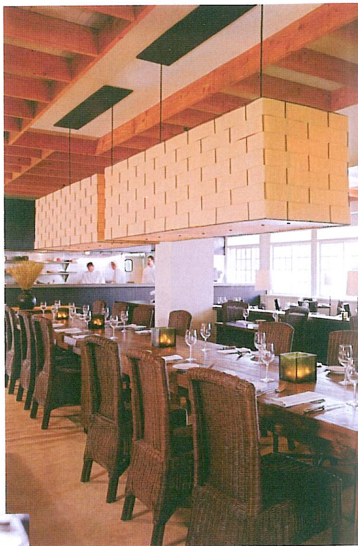
Right: take a seat at the big table. Below: the menu changes to suit the season.