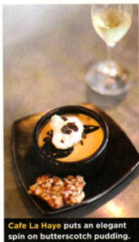
Cafe La Haye puts an elegant spin on butterscotch pudding.