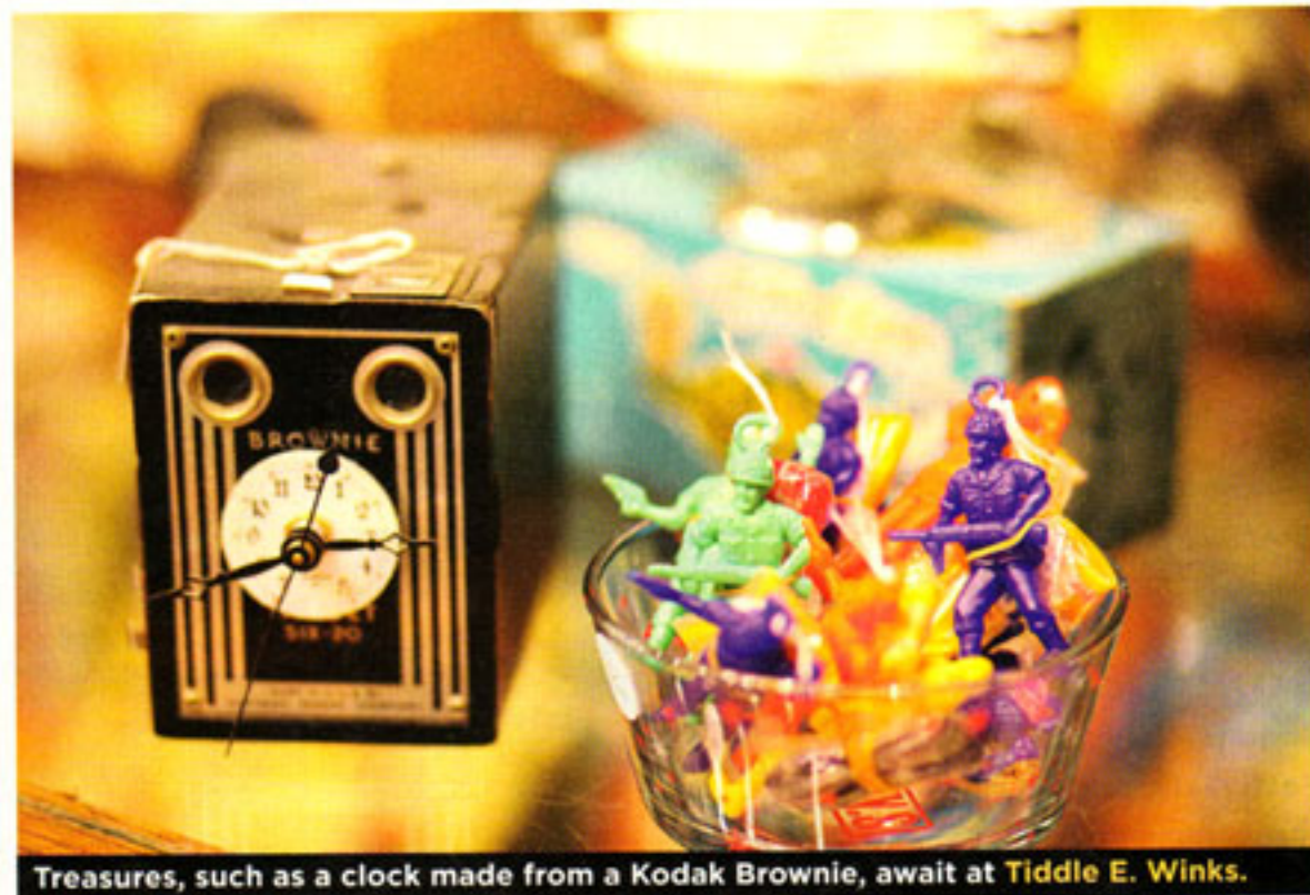
Treasures, such as a clock made from a Kodak Brownie, await at Tiddle E. Winks.

►► wine barrel tops. 435 First St. W., 996-3722. Tiddle E. Winks Vintage 5 & Dime Gumby and Pokey coffee mugs, Junior Mints lunch pails, and a wall of old-fashioned candy. 115 E. Napa St., 939-6933, tiddleewinks.com .