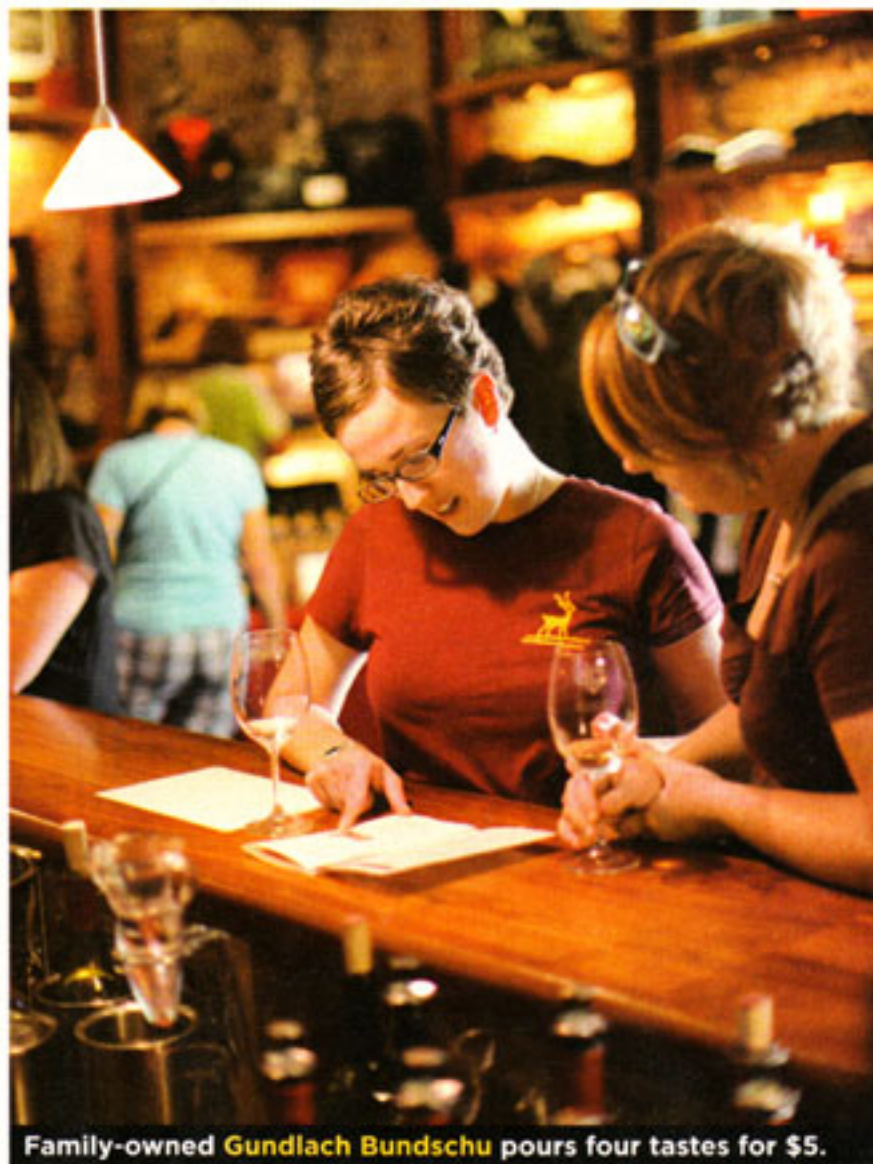
Family-owned Gundlach Bundschu pours four tastes for $5.