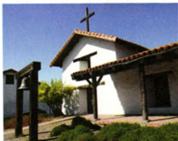
Tours of the mission run Friday-Sunday.