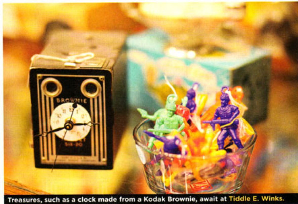
Treasures, such as a clock made from a Kodak Brownie, await at Tiddle E. Winks .

►► wine barrel tops. 435 First St. W., 996-3722. Tiddle E. Winks Vintage 5 & Dime Gumby and Pokey coffee mugs, Junior Mints lunch pails, and a wall of old-fashioned candy. 115 E. Napa St., 939-6933, tiddleewinks.com .