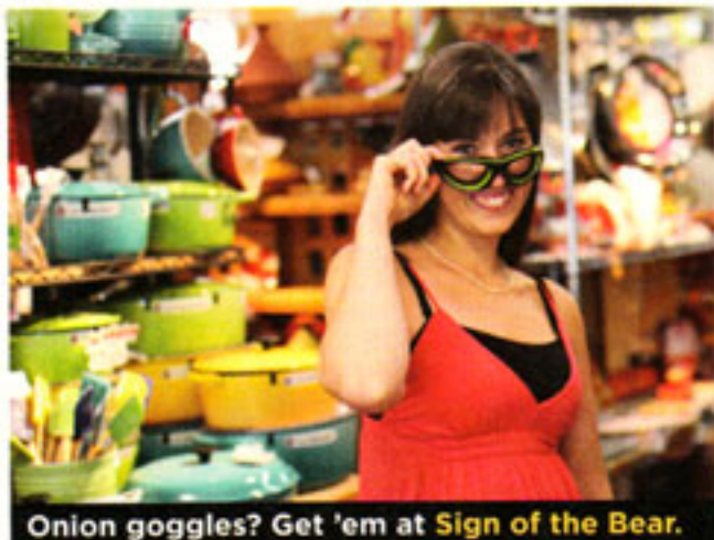
Onion goggles? Get 'em at Sign of the Bear .