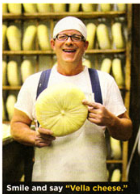
Smile and say "Vella cheese."

SHOPPING Sign of the Bear Kitchenware Panini grills, fancy cutlery, goat milk soap, and lazy Susans made from >>