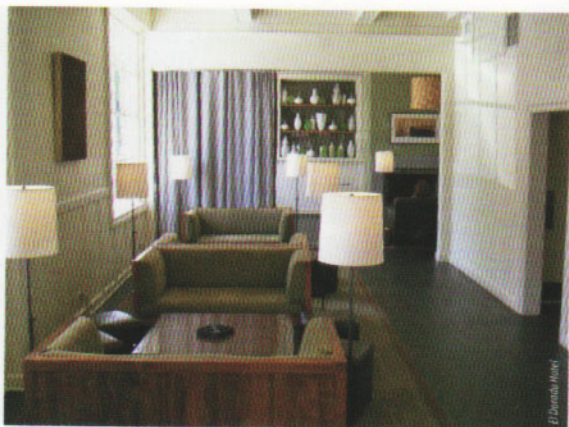
El Dorado Hotel

The El Dorado occupies a spot at the heart of historic Sonoma, located directly on Spanish Plaza in a recently renovated historic building. Laid out by Mariano Vallejo in 1835, the eight-acre site is the largest Mexican-era plaza in California.