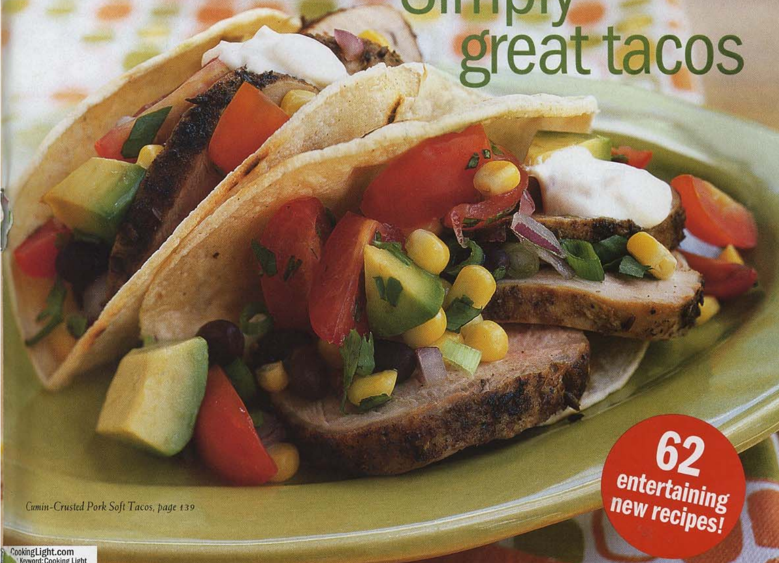
Cumin-Crusted Pork Soft Tacos, page 139