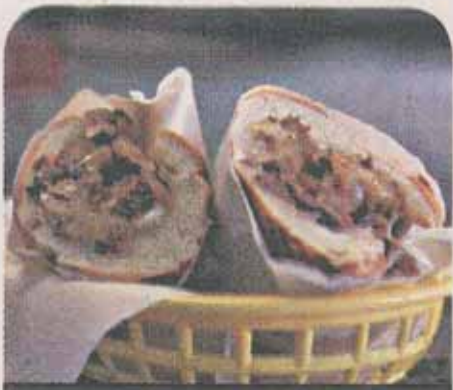
SATISFY PHILLY CRAVINGS IN S.F., PAGE 10