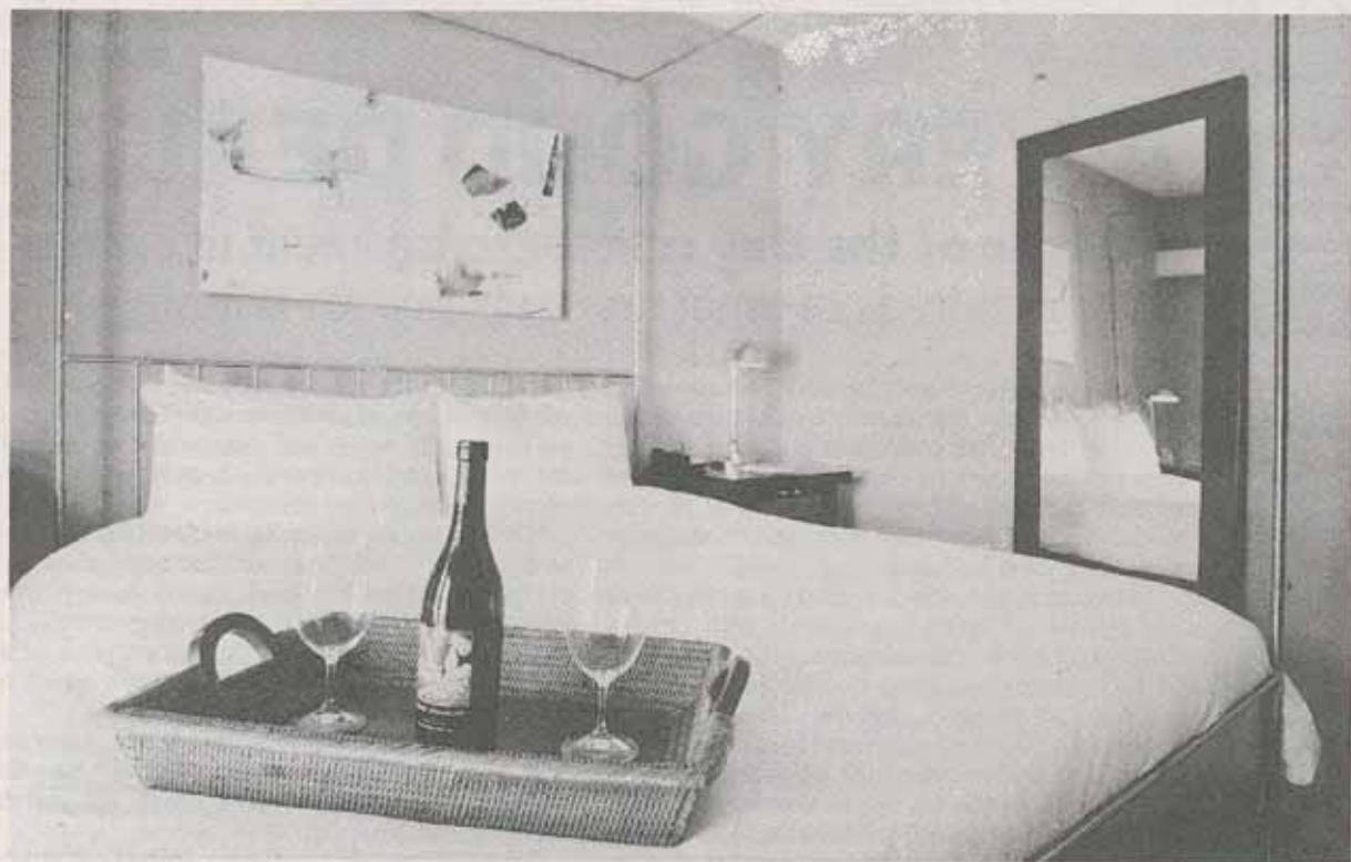
The El Dorado Hotel in Sonoma, above, is on the quaint downtown square and offers lovely outdoor spaces to enjoy, below left, plus rooms with private terraces featuring views of the pool and countryside.