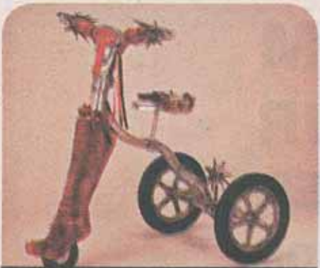
TRASH GETS NEW SPIN AT ART SHOW, PAGE 18