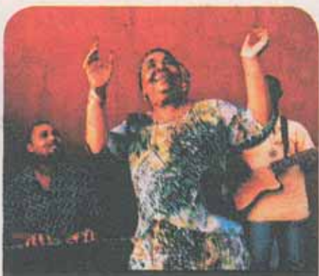
CESARIA EVORA, VOICE OF CAPE VERDE, PAGE 4