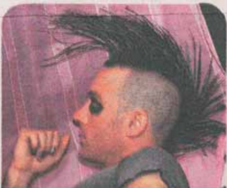
"EAVESDROPPER" HEARS ALL ONSTAGE, PAGE 14