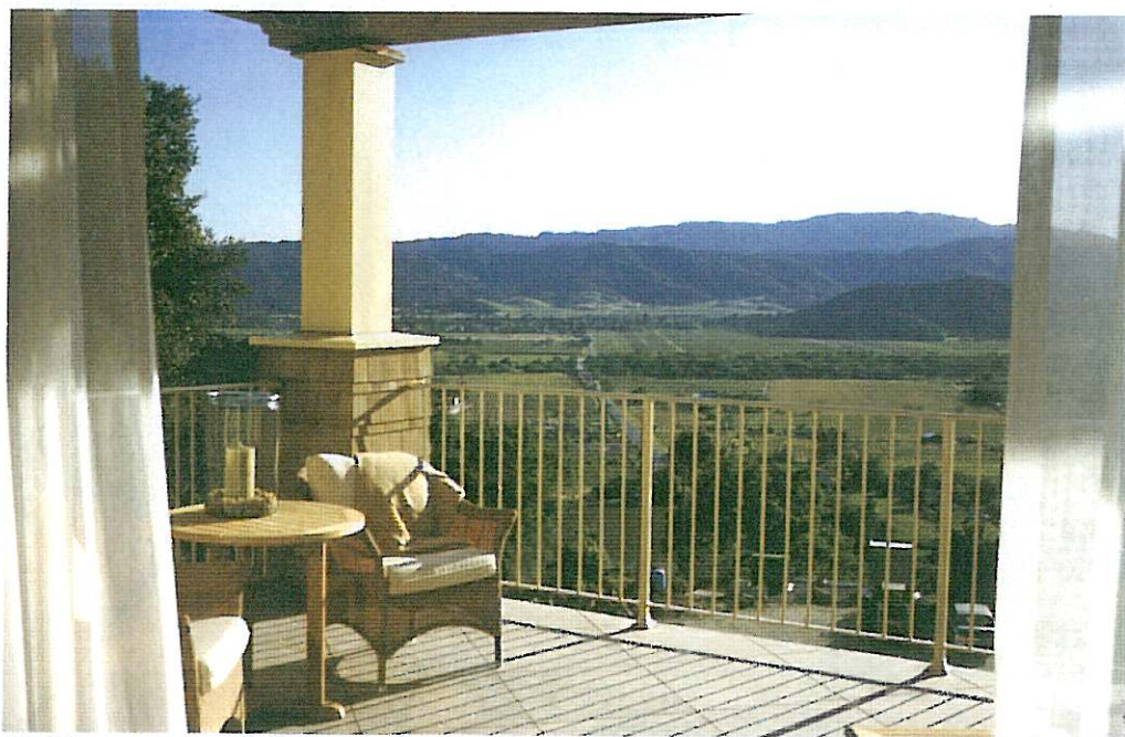
Pure poetry at the Poetry Inn, with its stellar views of the rolling Napa hills.